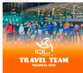
VALENCIA JANUARY 23