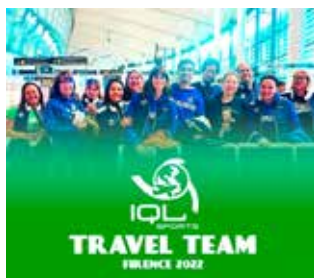
FLORENCE NOVEMBER 22