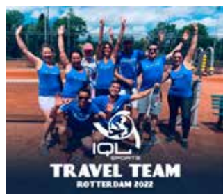
ROTTERDAM JUNE 22

Be part of our traveling team and join IQL Travel Team in our next trip.