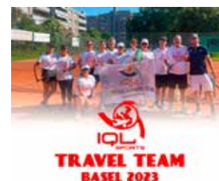
BASEL JUNE 23